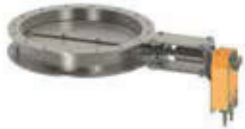
Clapeta motorizada 20Nm, 20s