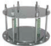
Válvula antiexplosión con unión embridada